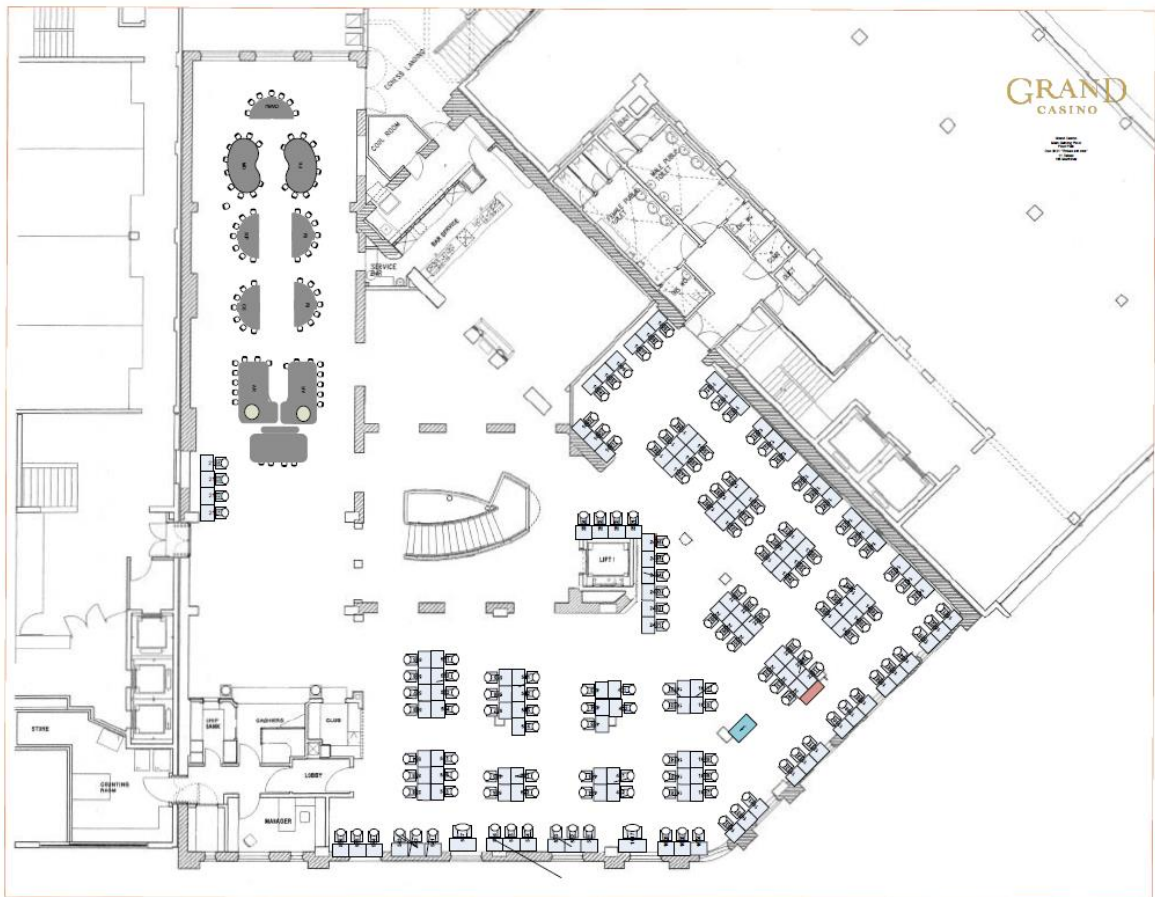
Current (post COVID-19) Floorplan of the Casino Gaming Area