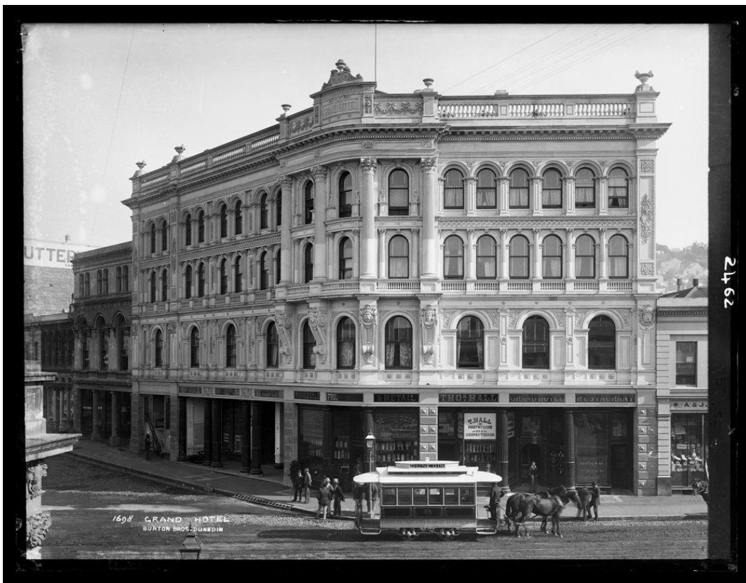
The Grand Hotel circa 1883-1885