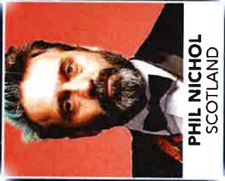
PHIL NICHOL SCOTLAND