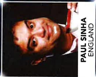
PAUL SINHA ENGLAND