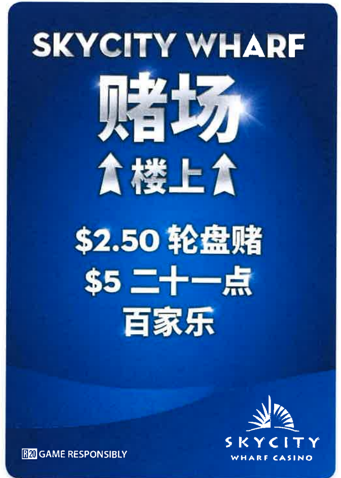
Sandwich Board, Reskin 500x900mm