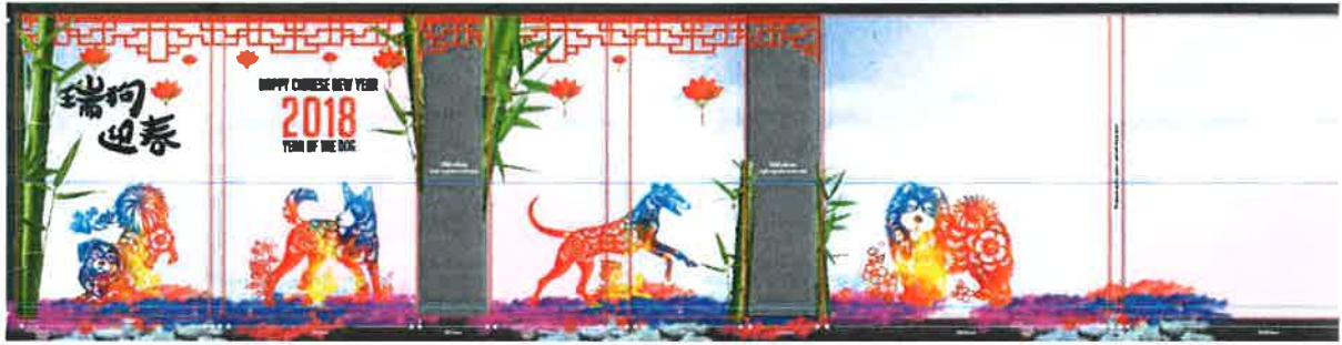
CNY - Foyer Corridor (left) part