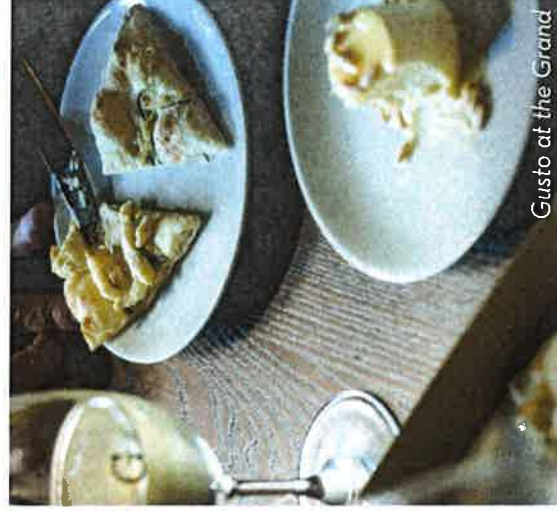
Gusto at the Grand

Offers are available during the Comedy Festival 2017 to Comedy Festival ticketholders on the day of the relevant show (as stated on the relevant ticketholder's ticket), subject to availability. Menu items may differ from those pictured. Bookings are subject to availability. P18 for the service of alcohol. Host Responsibility limits apply. Offers are not available in conjunction with any other offer.