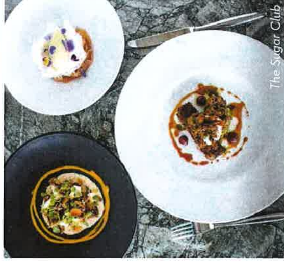
The Sugar Club