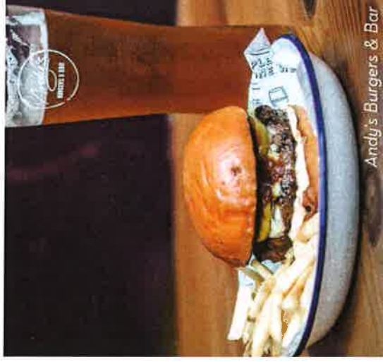
Andy's Burgers & Bar