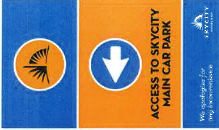
Sign at the entrance of Hobson Street car park entrance. Orange is reflective.