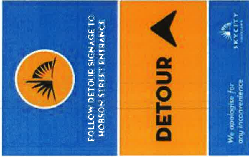
Main entrance sign. Large format print with reflective material.