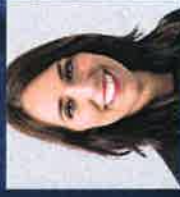
Jacinda Ardern Labour MP