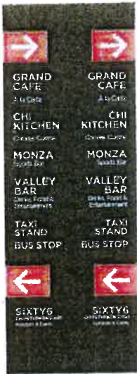
Overlay Size: 110x250mm