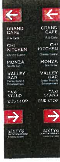
Overlay Size: 110x250mm