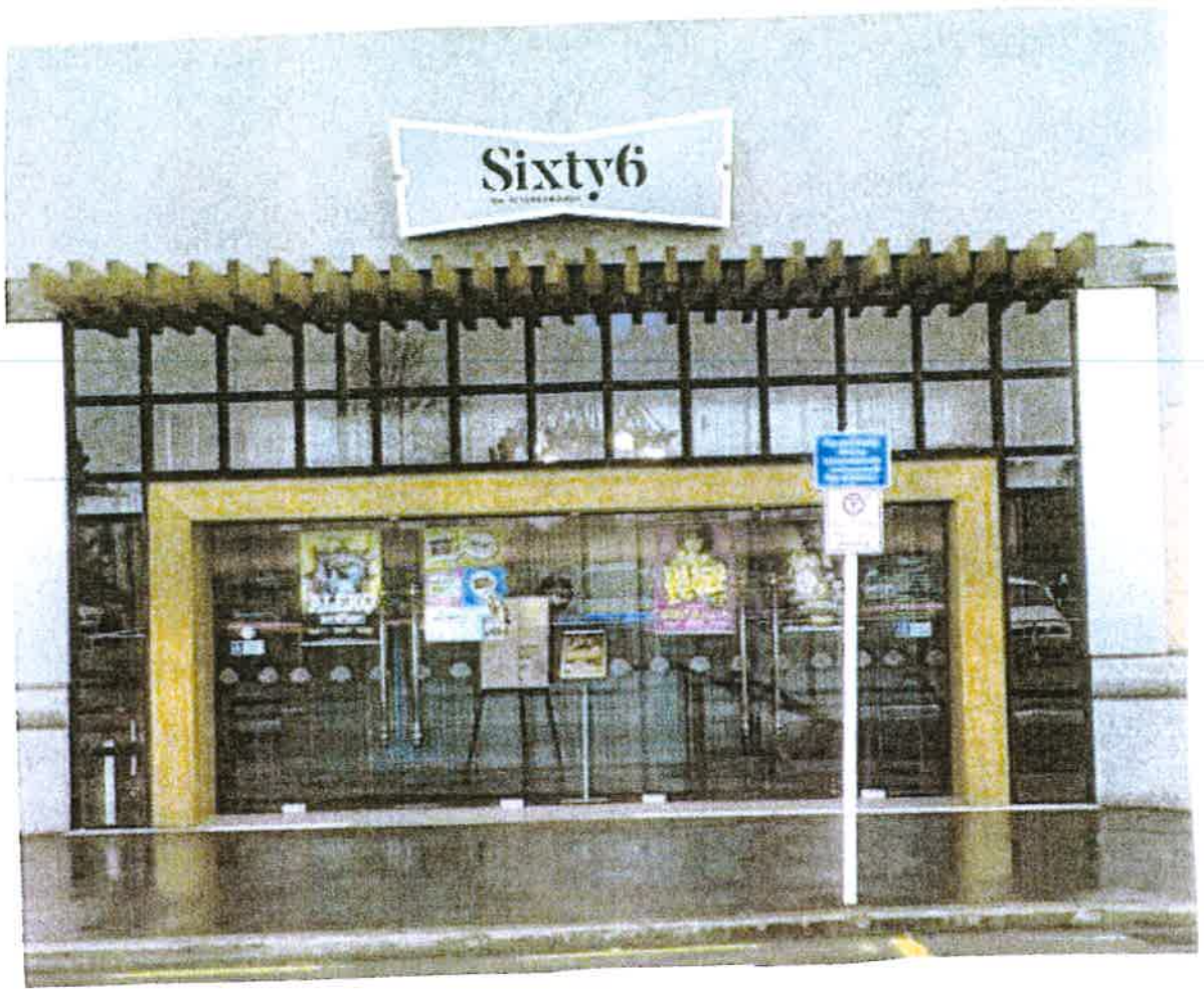
A - 460mm