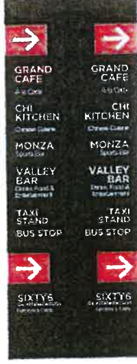
Overlay Size: 110x250mm