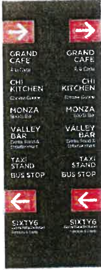
Overlay Size: 110x250mm