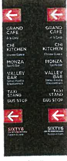
Overlay Size: 110x250mm