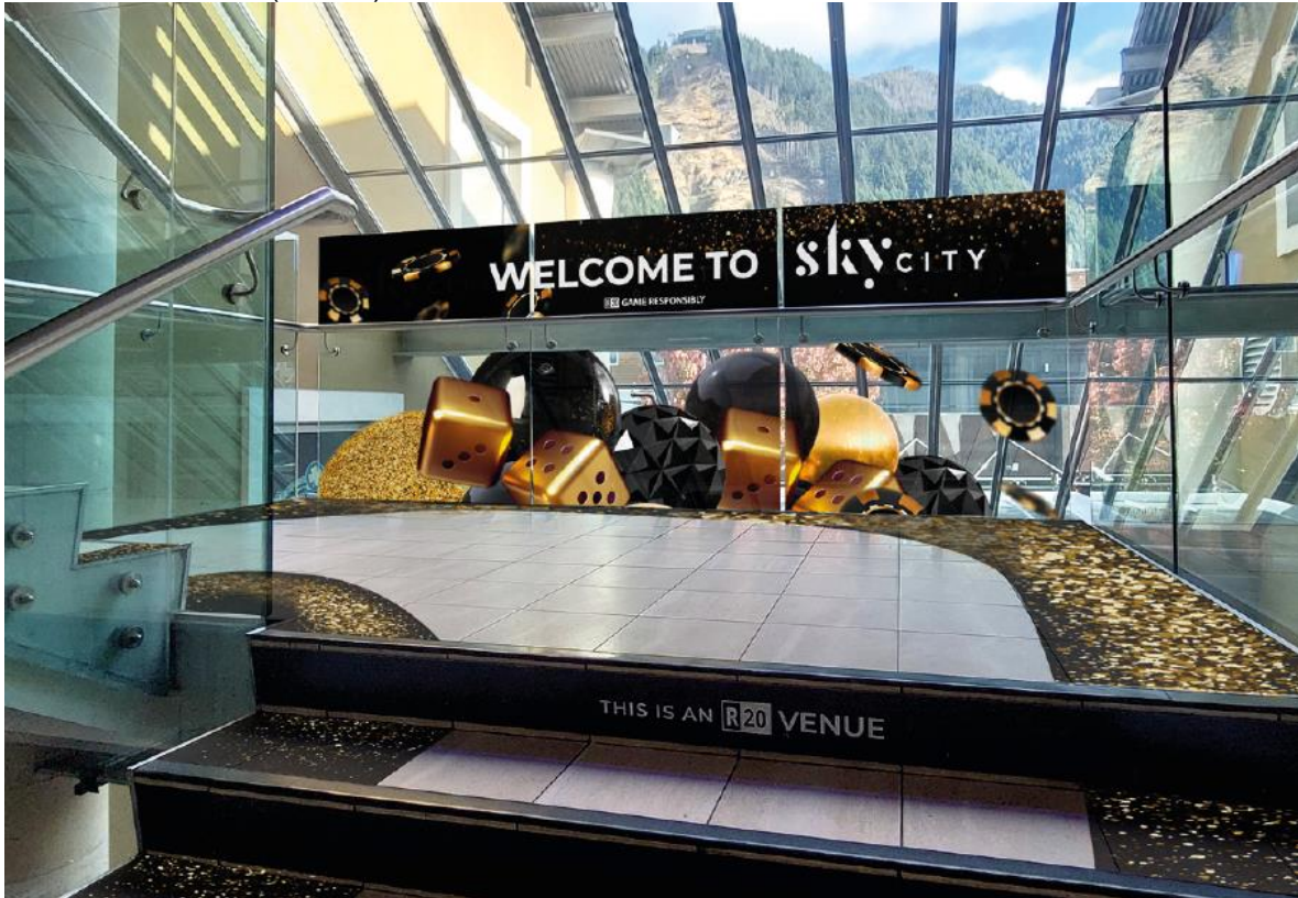
Top floor and stairs (Decals)