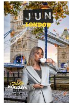
Screen/Window 1 Video 1