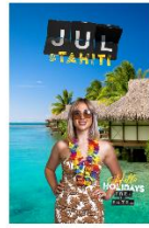
Screen/Window 2 Video 2