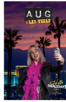
Screen/Window 3 Video 3