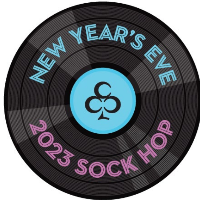
HNY Foamboard display (lobby, left side of the lift)