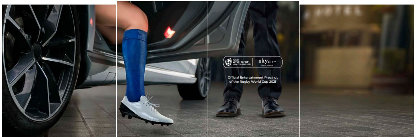
Atrium entrance centred