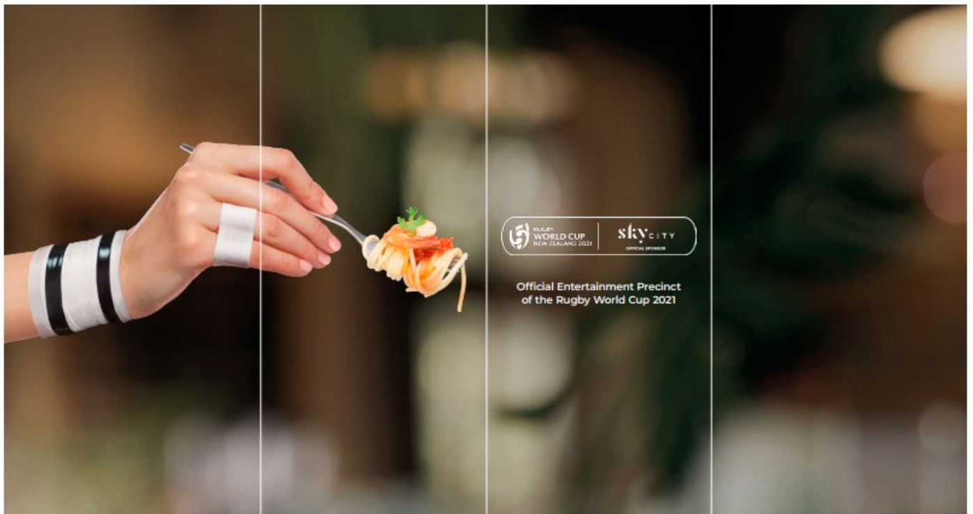
Atrium entrance left