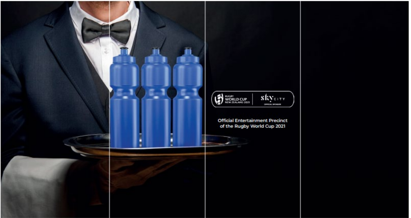
Atrium entrance right