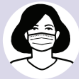
Wear a mask