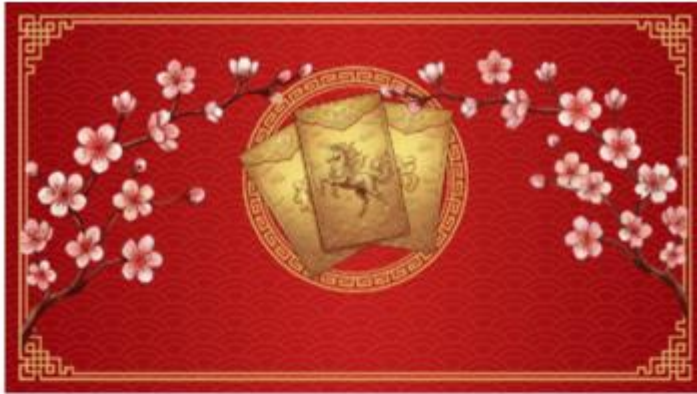
Foyer Screen - Pillar