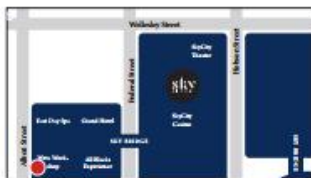
KEY: Sign Location