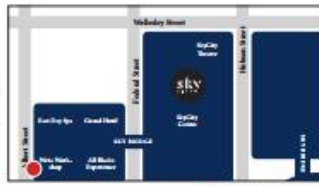
KEY: Sign Location