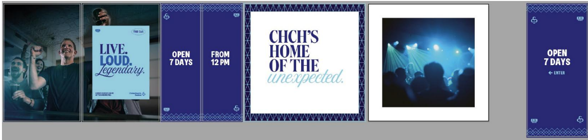
Victoria Street Main Foyer Windows – Right Hand Side (white background depicts clear window)